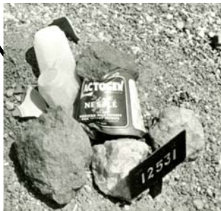
Infant's grave in Zambia, 1969

In his verdict the judge called on Nestlé to "fundamentally rethink its advertising policies" and said: "if the complainant in future wants to be spared the accusation of immoral and unethical conduct, he will have to change his advertising practices."