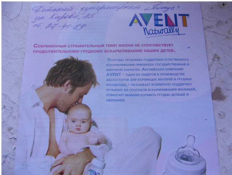
Figure 1. Advertisement from AVENT