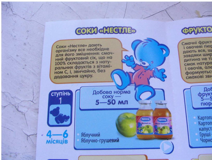
Figure 2. Advertisement for Nestlé juices